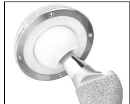
Figure 1: Alumina–alumina THA can feature titanium shells that accept polyethylene, CoCr, or alumina bearings interchangeably (Lineage acetabular component; Wright Medical Technology Inc, Arlington, Tenn).

One US clinical study included 1196 THAs performed between April 1997 and March 2002 (Transcend and Lineage acetabular components; Wright Medical Technology, Arlington, Tenn). Of these, 405 hips were followed for a minimum of 24 months (mean: 30.5 months, range: 24–56 months). Average patient age was 53 years. Results showed no postoperative bearing fractures and no osteolysis thus